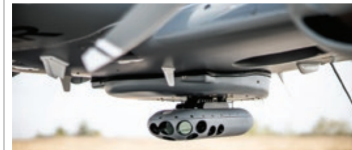
Eye in the sky: The ViDAR self-contained aerial reconnaissance (SCAR) day/night 'optical radar' pod