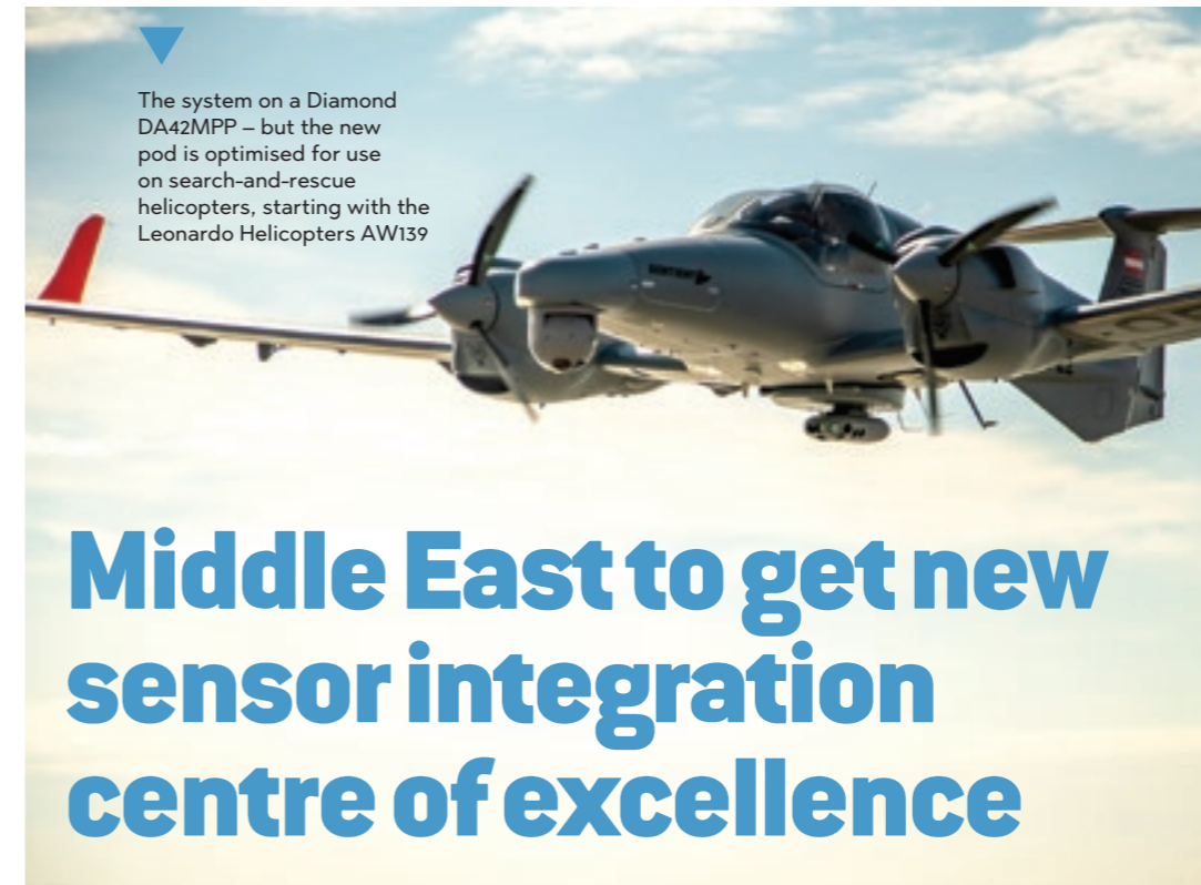
The system on a Diamond DA42MPP – but the new pod is optimised for use on search-and-rescue helicopters, starting with the Leonardo Helicopters AW139