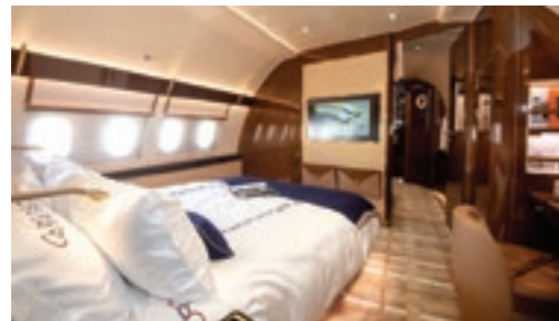
The aircraft features an angled bed that can be approached from either side, rather than one guest having to clamber across

Pickardt concluded: "You also have a seat for an engineer or extra crew member, which is new. The aircraft is not only comfortable for the customers, but also for the crew. On long flights we need the crew to be able to relax and feel comfortable." ▲