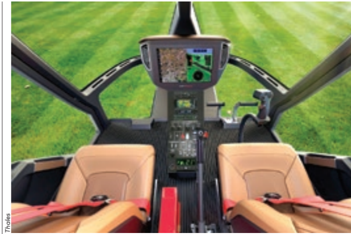
▲ The new FlytX avionic suite was designed to be lightweight but offer better performance than previous products

available as new or retrofit, introduces a new way of displaying flight information, including a new timeline concept to create the link between flight phases and associated necessary tasks that need to be completed.