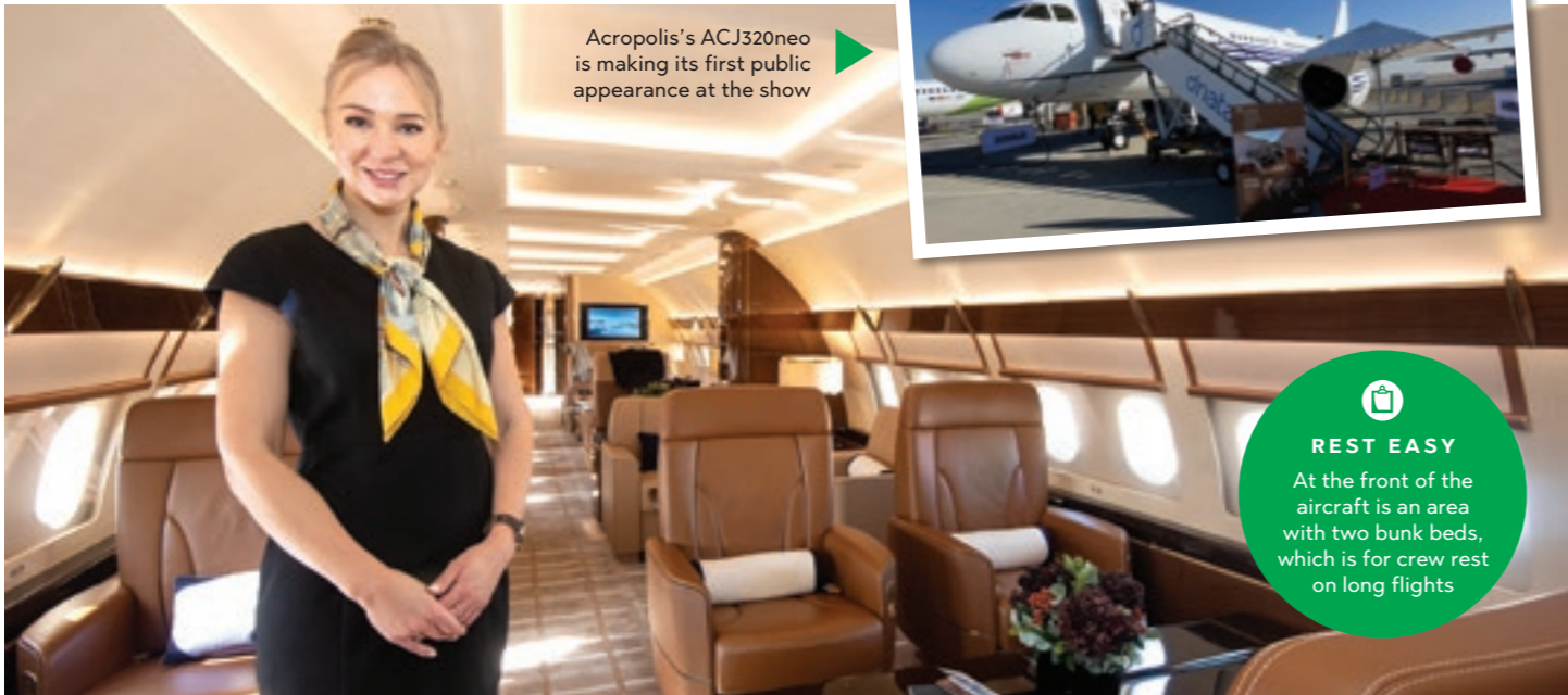
Acropolis's ACJ320neo is making its first public appearance at the show

REST EASY At the front of the aircraft is an area with two bunk beds, which is for crew rest on long flights