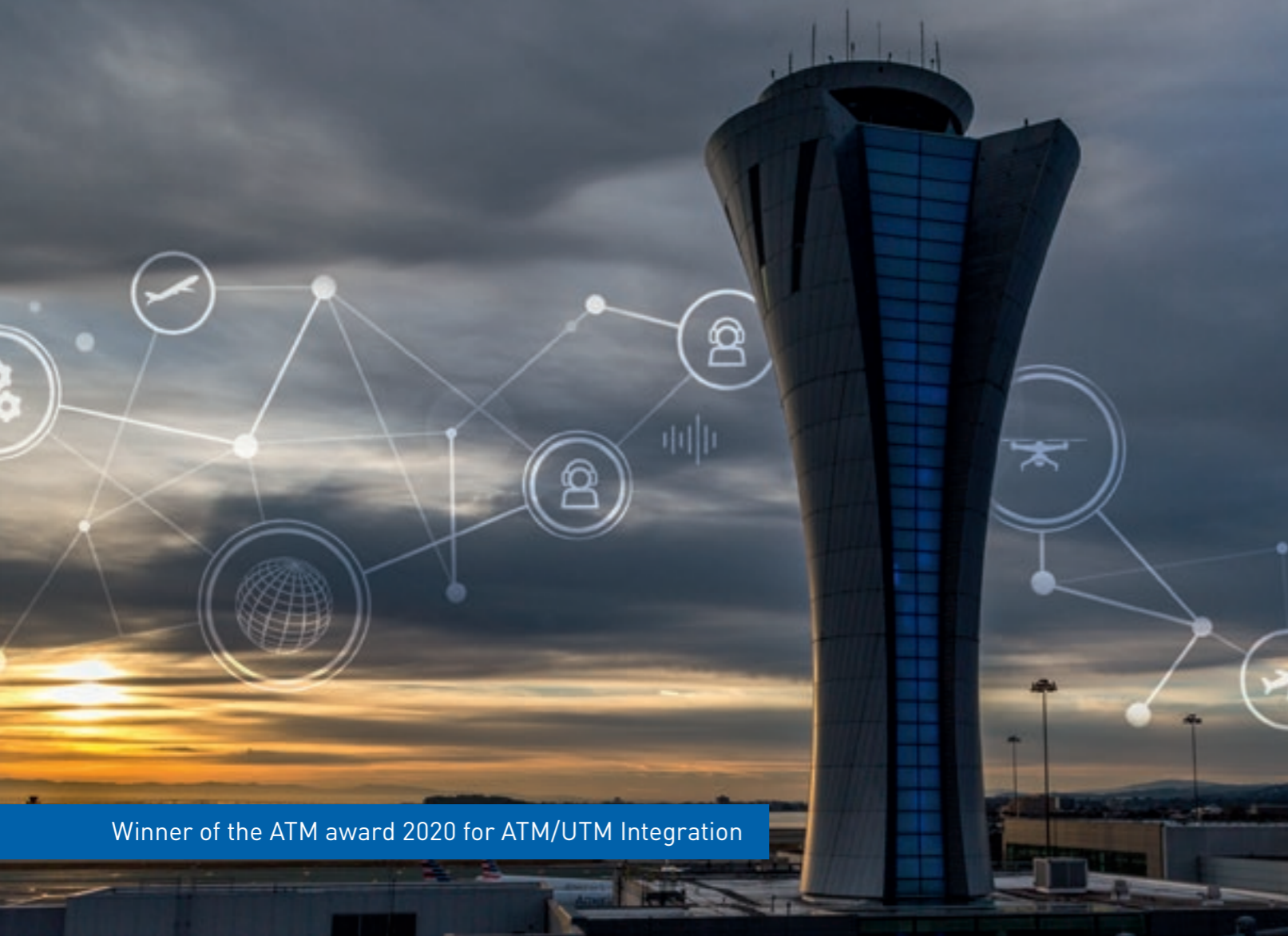
Winner of the ATM award 2020 for ATM/UTM Integration